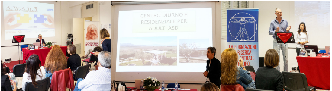
Partners' meeting in Cagliari (Italy) 29th of October 2018

A.W.A.R.D.'s Partnership is composed by organizations which make available their know-how and shared interest in supporting the employment of young people with autism.