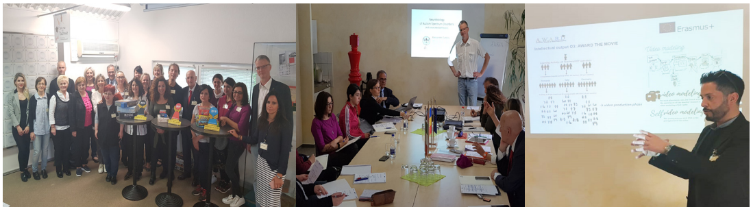
Partners' meeting during the Learning activity Chemnitz (Germany) from the 21st to 24th of May 2019