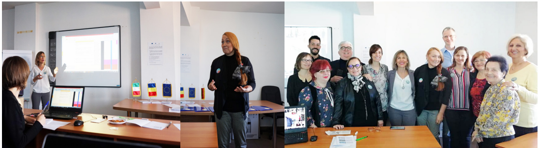
Partners' meeting in Timisoara (Romania), 28th of March 2019